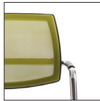
In mesh (Wait Mesh)