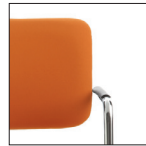
Padded and upholstered (Wait Fabric)