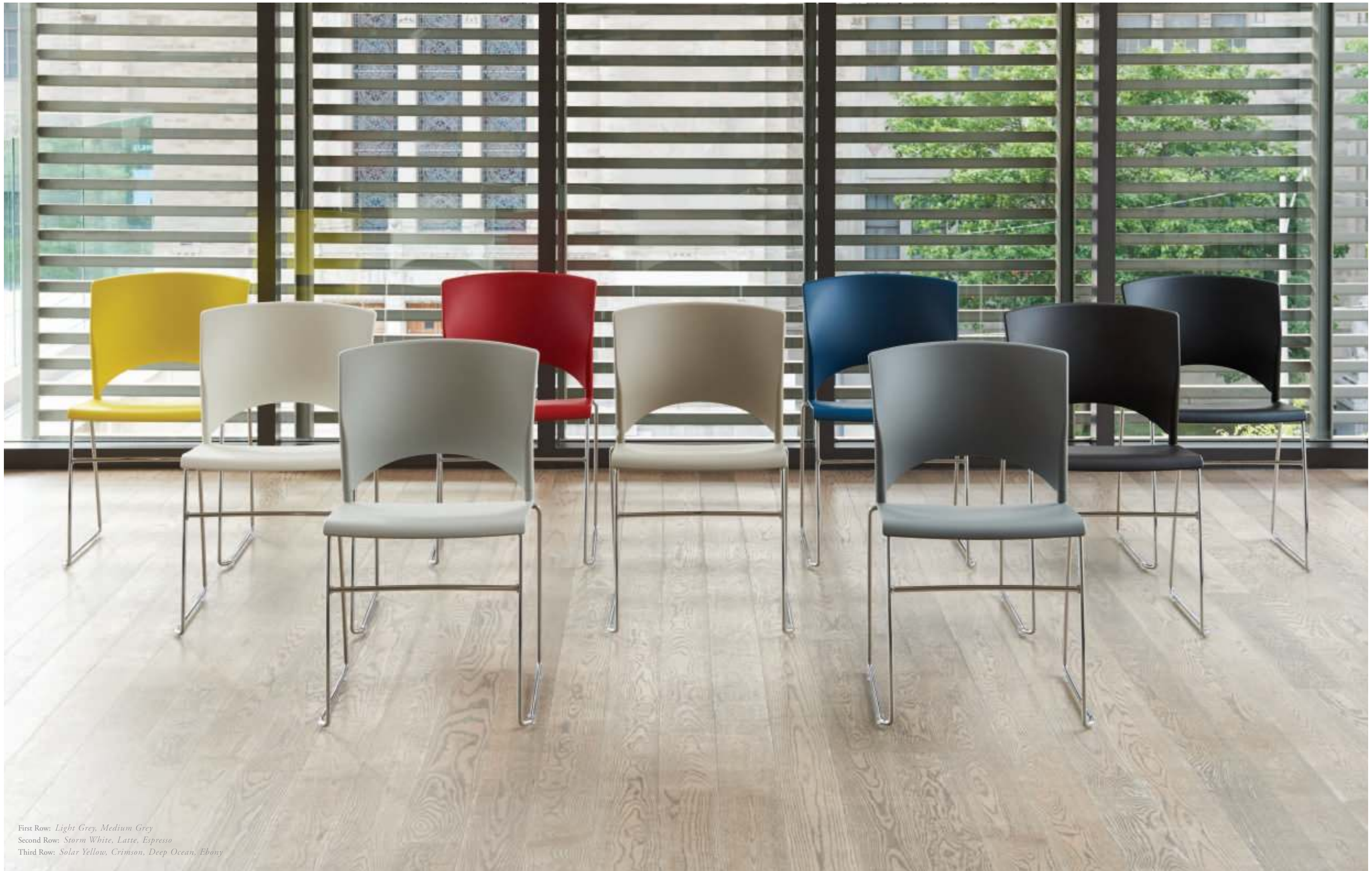
First Row: Light Grey, Medium Grey Second Row: Storm White, Latte, Espresso Third Row: Solar Yellow, Crimson, Deep Ocean, Ebony