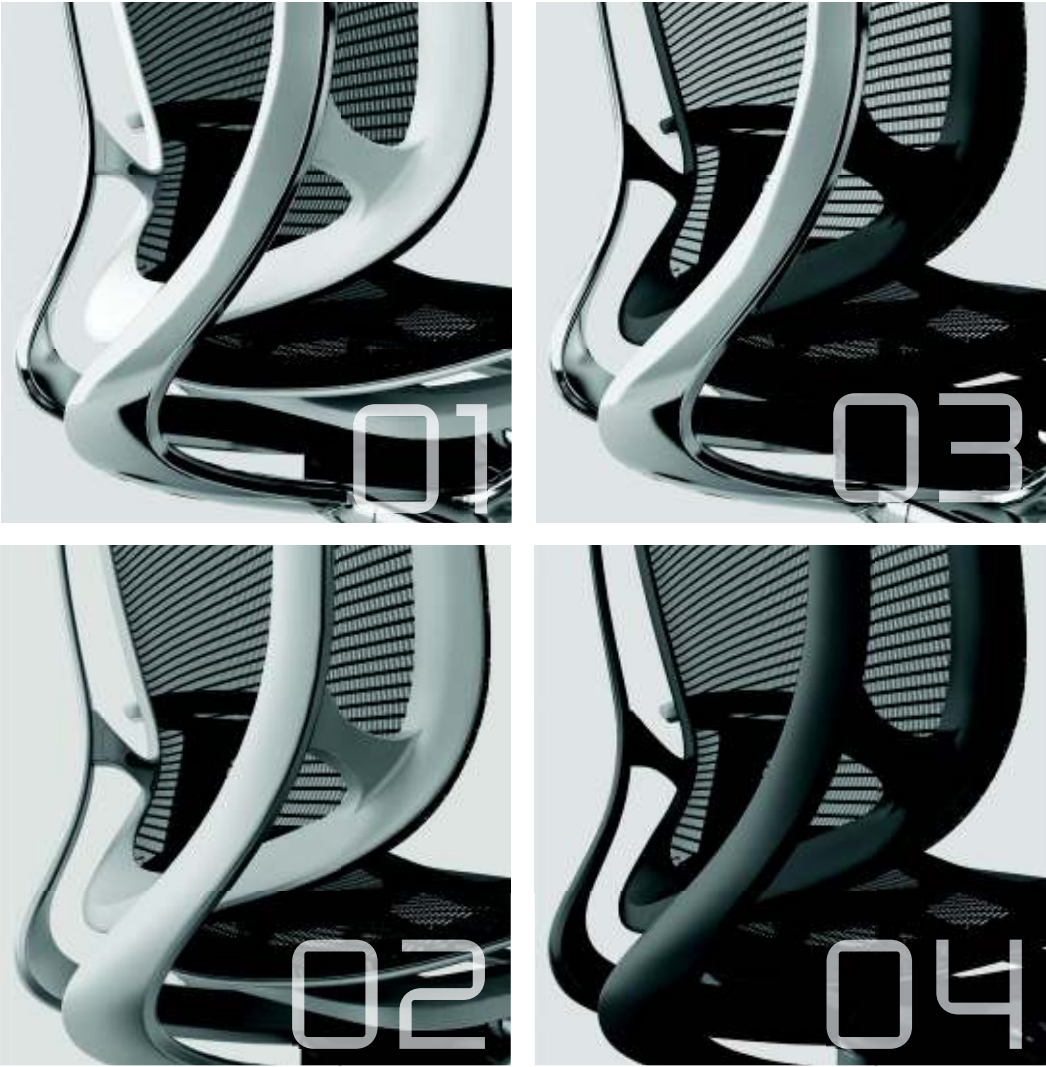
01 very white/polished aluminum 02 tess silver/grey 03 ebony/polished aluminum 04 ebony/ebony