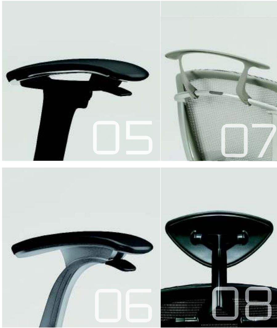
05 4d arm Adjusts in height, width, depth and pivot, ideal for heavy task use 06 fixed arm Suitable for touchdown and meeting spaces when less functionality is required 07 coat hanger 08 headrest Adjusts in height, depth and angle

Nuova Contessa’s Nu-Tess Mesh utilizes a zahedral weave that enables the chair back to retain its tensile strength with the ability to conform to and support the body. Two distinct weaves are used for the mesh seat and back, providing the appropriate