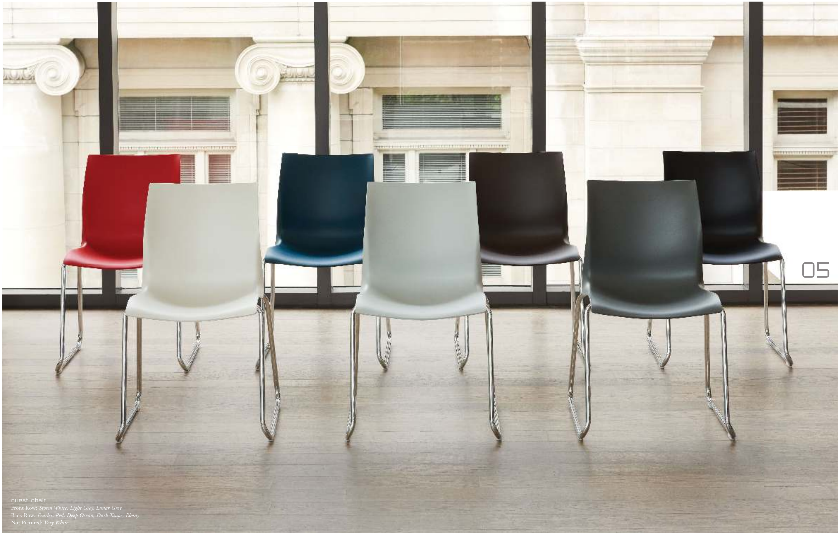
guest chair Front Row: Storm White, Light Grey, Lunar Grey Back Row: Fearless Red, Deep Ocean, Dark Taupe, Ebony Not Pictured: Very White