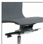
Tilting with 4-position adjustment