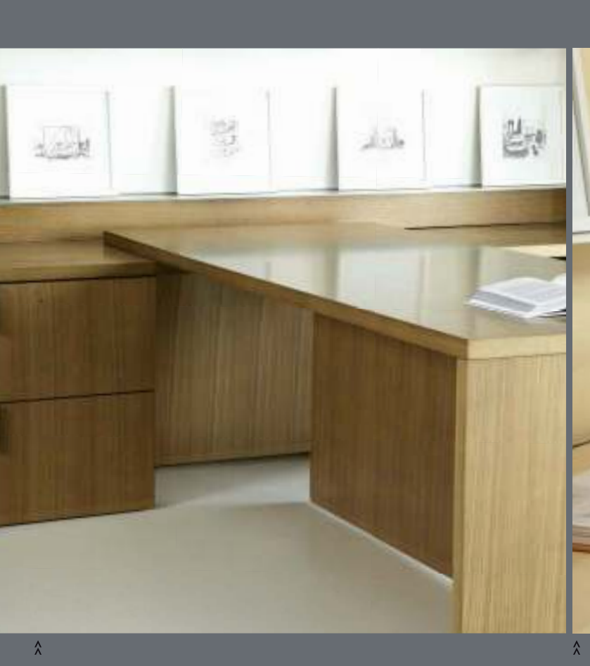
Runoff surfaces overlap 27½-inch-high credenzas or may be connected flush at 29 inches.

Desks, tables and open runoffs are available with veneer, white back-painted glass or white solid surface material.