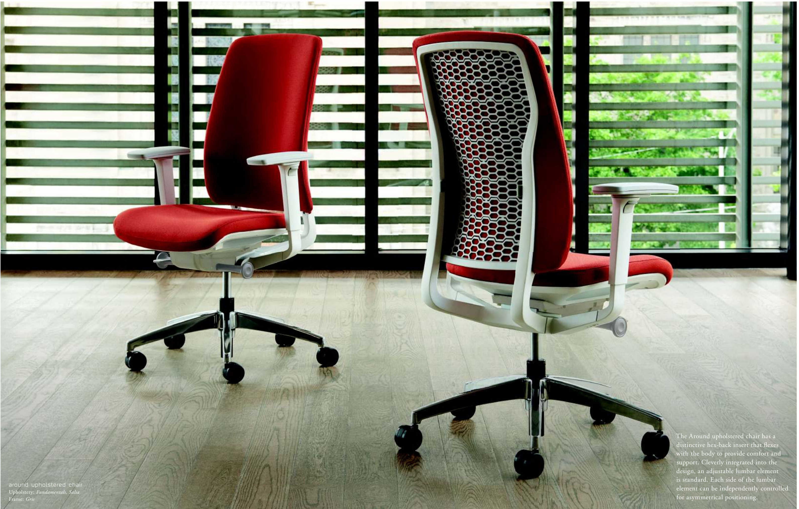
around upholstered chair Upholstery: Fundamentals, Salsa Frame: Gris

The Around upholstered chair has a distinctive hex-back insert that flexes with the body to provide comfort and support. Cleverly integrated into the design, an adjustable lumbar element is standard. Each side of the lumbar element can be independently controlled for asymmetrical positioning.