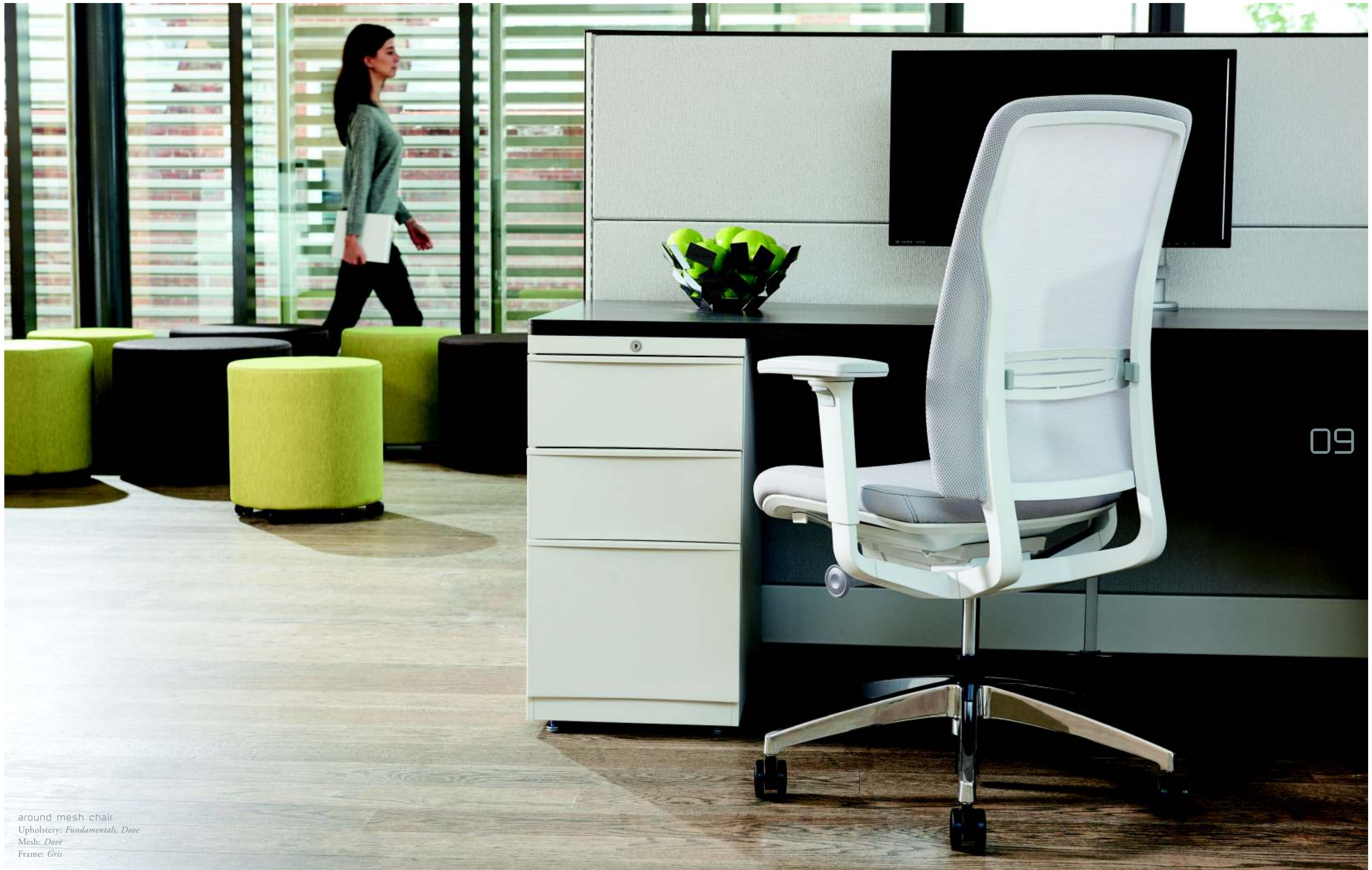
around mesh chair Upholstery: Fundamentals, Dove Mesh: Dove Frame: Gris