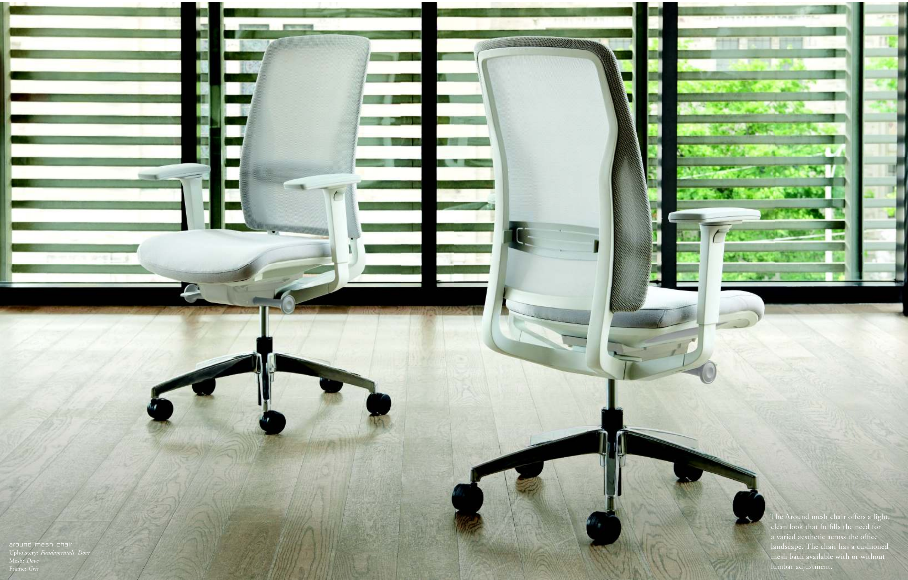
around mesh chair Upholstery: Fundamentals, Dove Mesh: Dove Frame: Gris

The Around mesh chair offers a light, clean look that fulfills the need for a varied aesthetic across the office landscape. The chair has a cushioned mesh back available with or without lumbar adjustment.